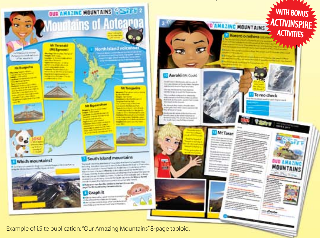
Example of i.Site publication: "Our Amazing Mountains" 8-page tabloid.