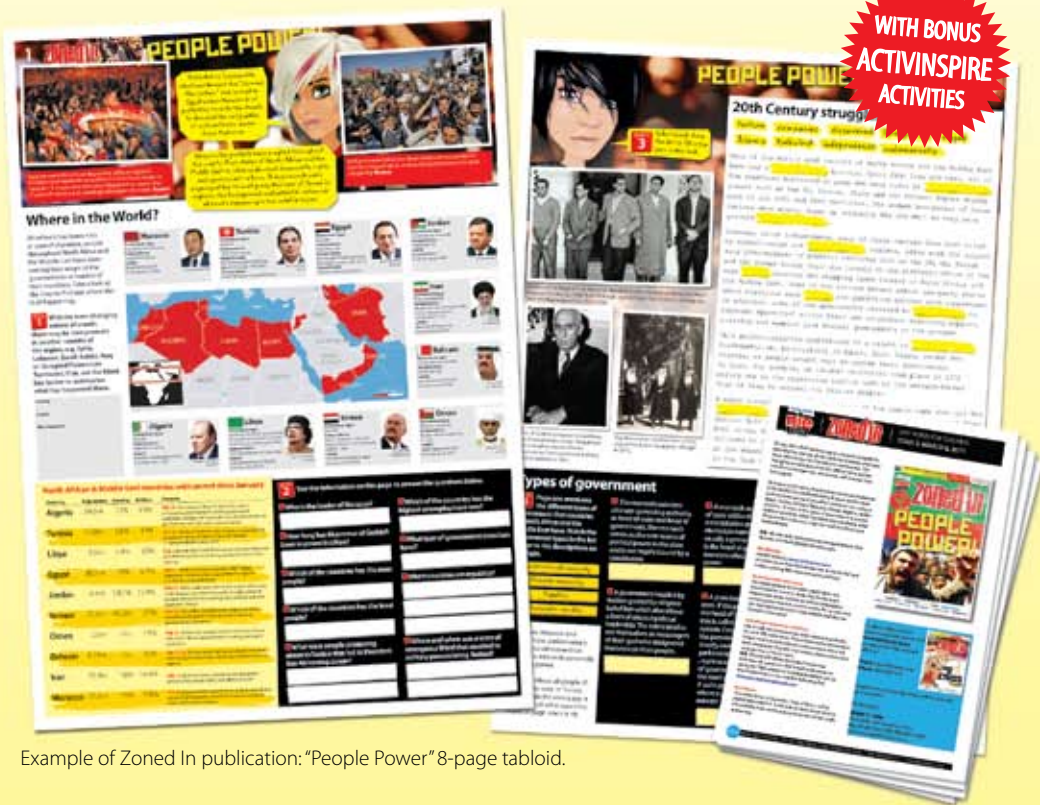
Example of Zoned In publication: "People Power" 8-page tabloid.