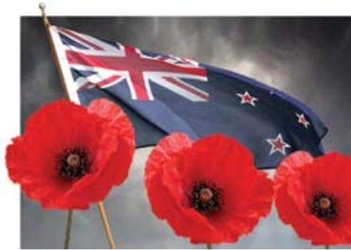
April 24 Anzac Day 2012: Kiwi Soldiers At War