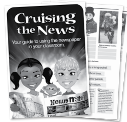
Cruising The News

Enable your students to get more from the newspaper with these handy resources.