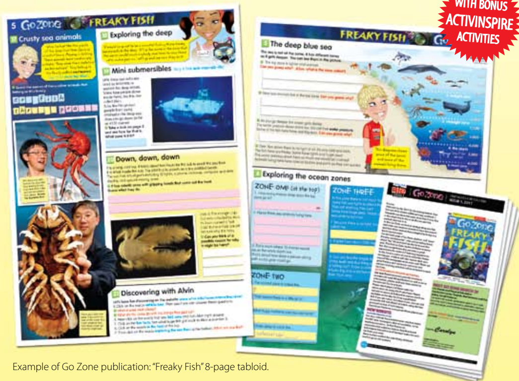
Example of Go Zone publication: "Freaky Fish" 8-page tabloid.