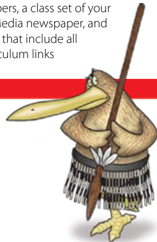
June Māori Focus Month

Teachers ordering this special edition will receive a class set of 'Kiwi Soldiers at War' mini newspapers, a class set of your local Fairfax Media newspaper, and teacher notes that include all relevant curriculum links