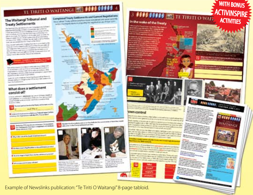
Example of Newslinks publication: "Te Tiriti O Waitangi" 8-page tabloid.