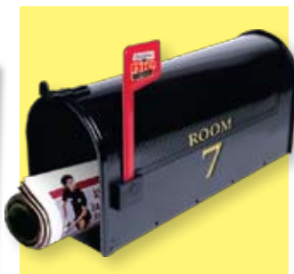
Classroom daily newspaper

You will also receive free teacher notes with curriculum links, activities and a class set of your local Fairfax daily newspaper.