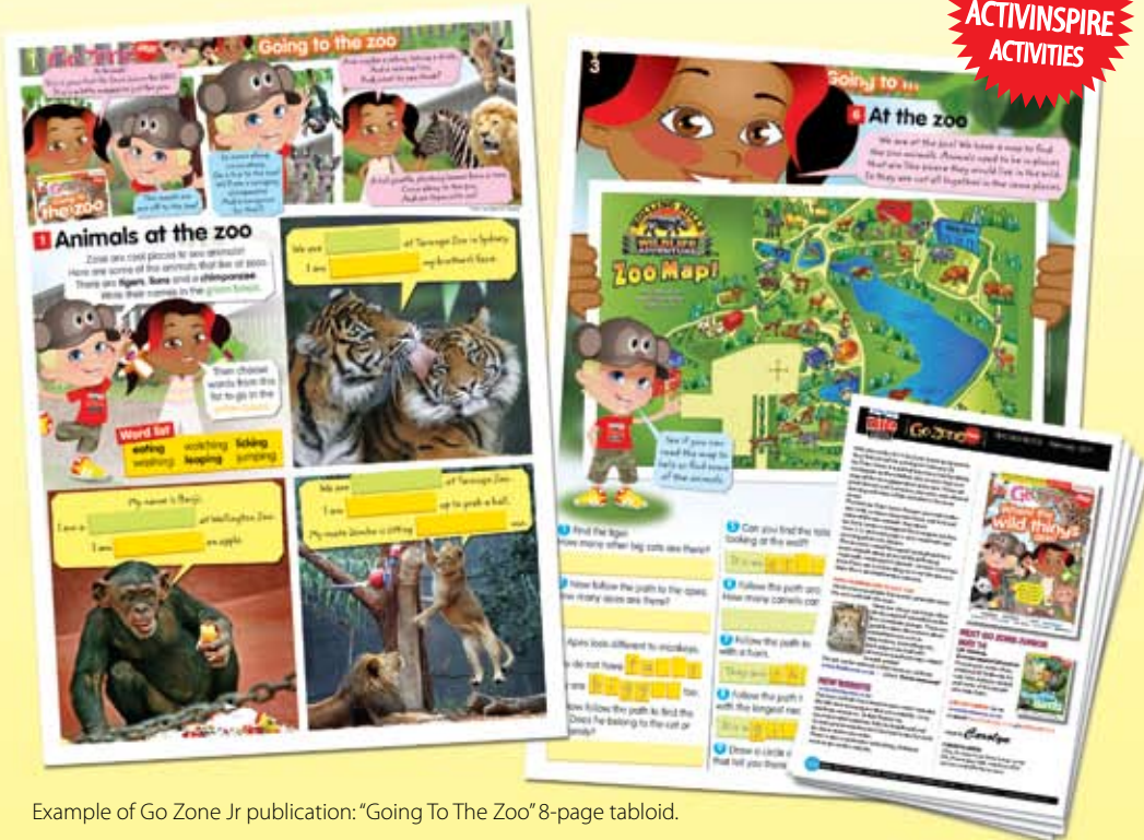
Example of Go Zone Jr publication: "Going To The Zoo" 8-page tabloid.