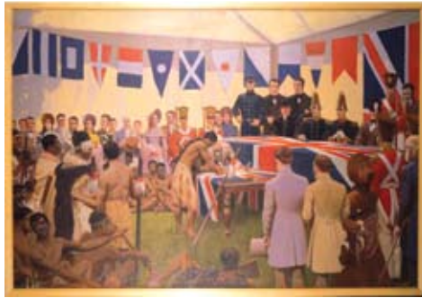
January 31 The Treaty of Waitangi

NiE has all the curriculum-based resources you need to cover important annual New Zealand events with your students.