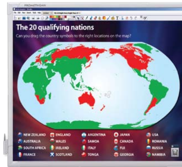
Slide example from Zoned In "Right Here, Right Now" flip chart

The personal edition of the ActivInspire software is available for free download from Promethean Planet. If you don't have an ActivBoard you can apply for a teacher consent licence which allows you to use NiE flipcharts on non-Promethean interactive whiteboards - visit http://bit.ly/dYOEjM to apply.